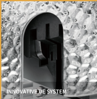
INNOVATIVE DE SYSTEM