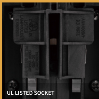
UL LISTED SOCKET