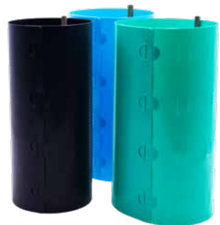
Sure Shape Wraps come in two sizes – larger size is adjustable

Contact us for a custom quote on the size and color that's right for your operation: