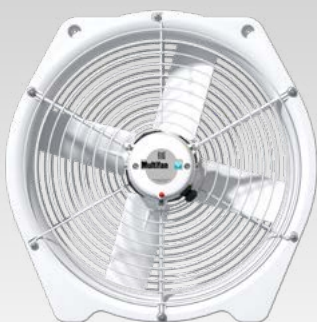
45 cm Greenhouse Fan