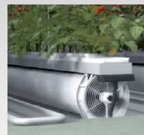
Simple to attach air hoses