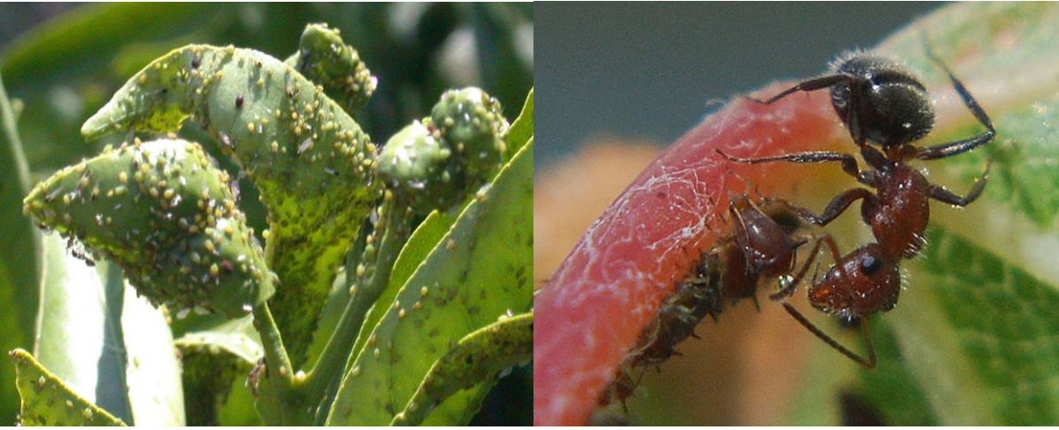
(Left) Fallbrook California; Argentine ants farming and protecting Homopterous, plant piercing, sucking insects on citrus tree. (Right) Nokomis Florida; Compact carpenter ant, recently introduced from Cuba, harvesting honeydew from aphids on grape vine.

The ant activated AntPro insect bait delivery system employs natural amino acids and carbohydrates in a low-toxicity liquid ant attractant bait as a target-specific replacement for continuous applications of expensive broad-spectrum soil-damaging insecticides. Thus, providing a viable means of protection for beneficial insect predators while manipulating and depopulating targeted ant colonies.